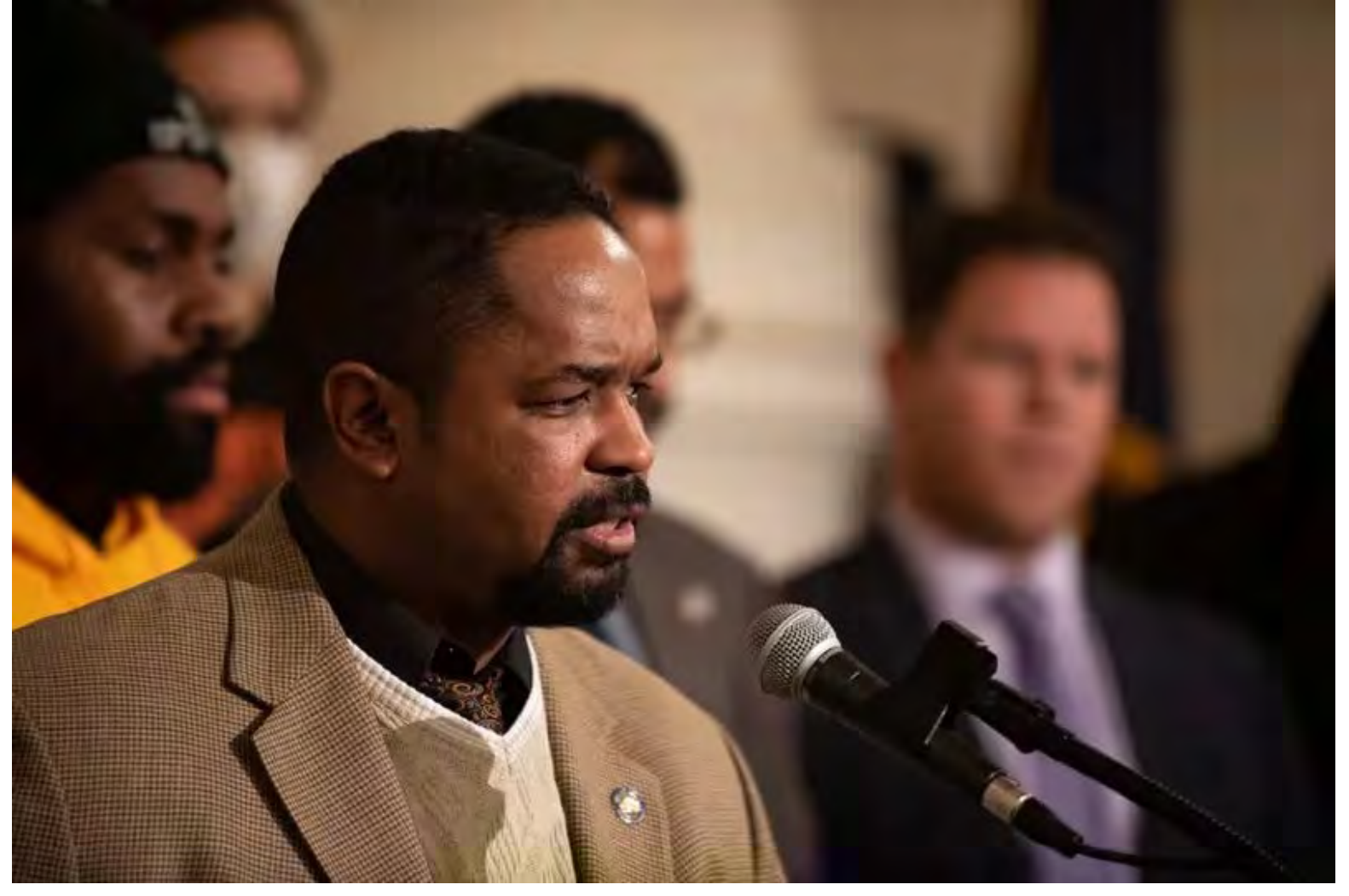
Democratic State Sen. Sharif Street has called Act 40 a law enforcement measure that's masquerading as a transportation law. Erin Blewett

And this is just the latest attempt by the legislature to target Krasner, who was the subject of an unsuccessful — and misguided — impeachment effort in Harrisburg just last year.