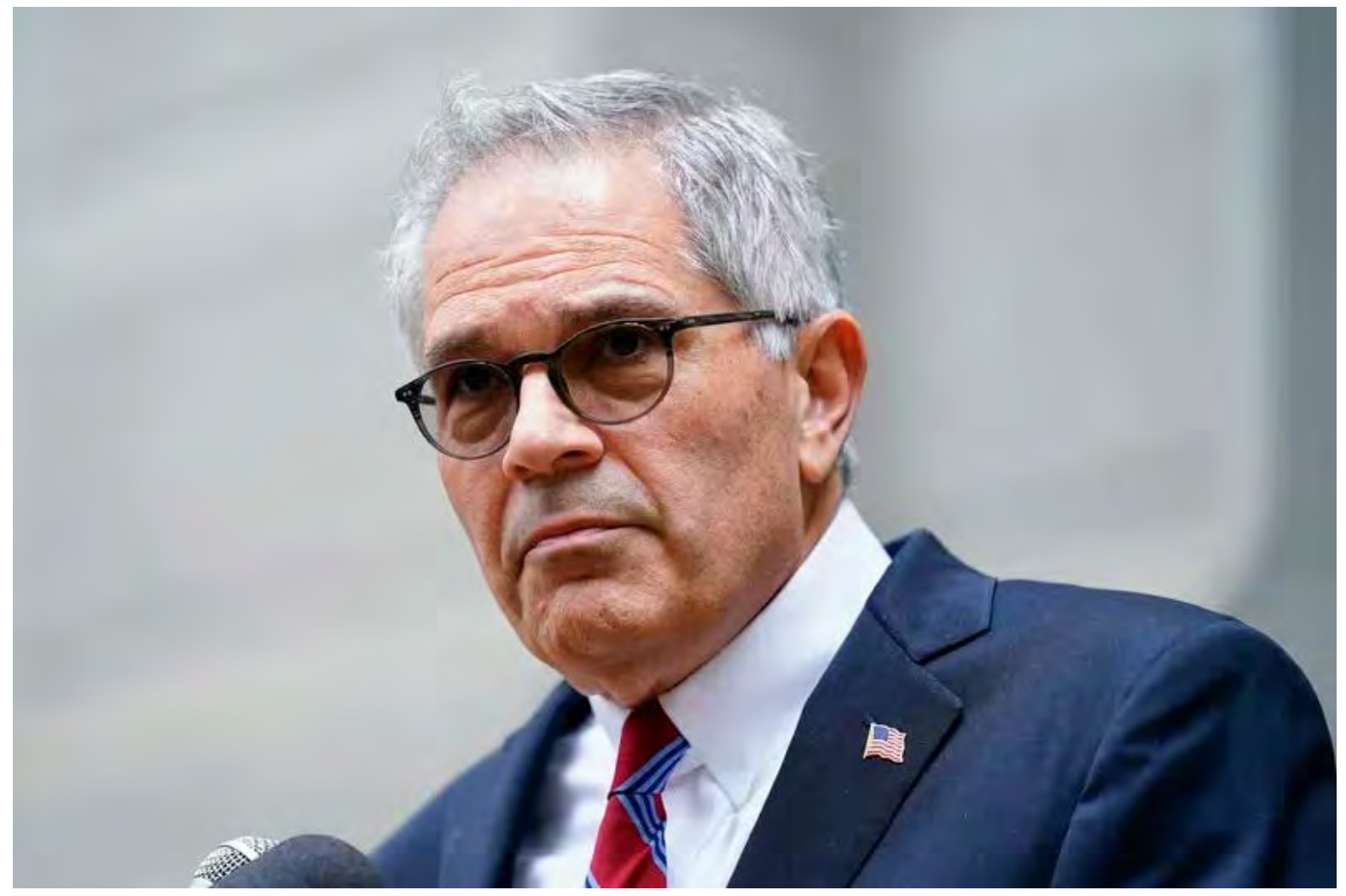
Philadelphia District Attorney Larry Krasner speaks with members of the media during a news conference in Philadelphia on Oct. 13, 2022.

The law allows the state to appoint a special prosecutor for crimes that occur near SEPTA property. It also disempowers the Black and brown people who make up the bulk of the city's population.