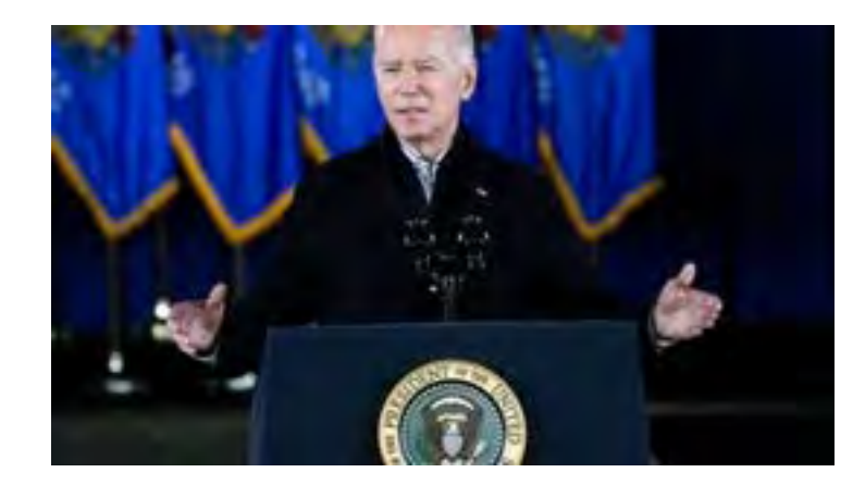
WATCH: Biden marks Jan. 6 anniversary with campaign speech on democracy